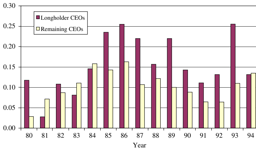
Fig. 1. Merger frequency (I): probability of completing a merger. The figure displays year-by-year merger frequencies, separately for Longholder CEOs and the remaining sample of CEOs. For each subgroup, the frequency is calculated as the number of CEOs who completed at least one merger divided by the total number of CEOs in that subgroup in a given year. Years are fiscal years.